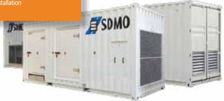
CIR20 SSI (Super Silent)