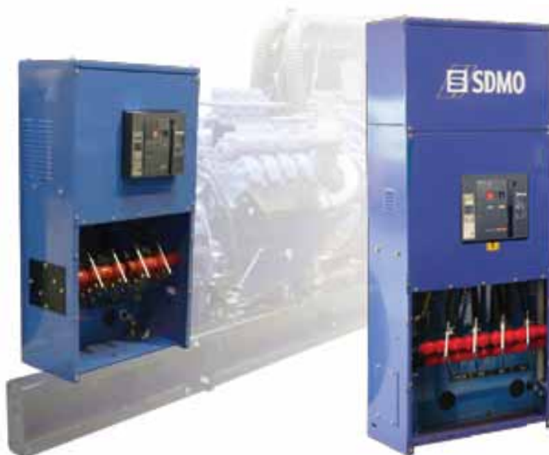
1 connection unit without air cooler unit

It is located on the right-hand side of the generating set. This AIPR function is also adapted for containers.